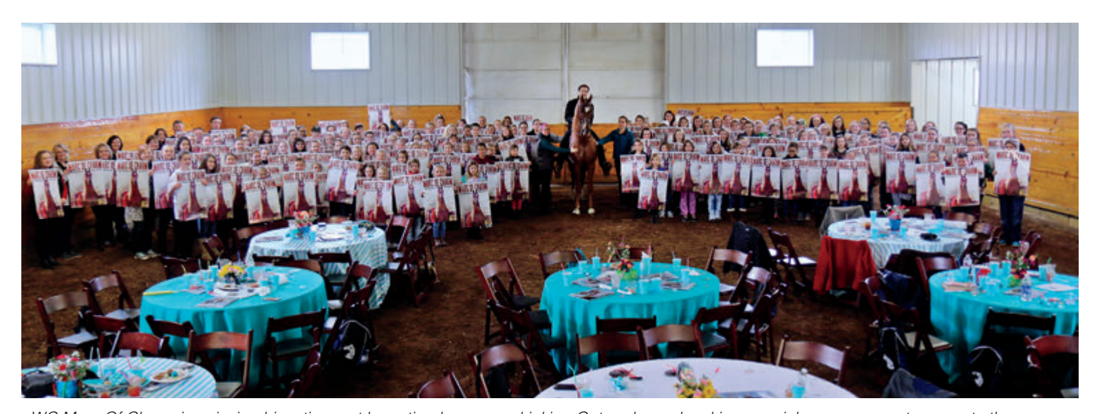
WC Marc Of Charm is enjoying his retirement by eating bananas, drinking Gatorade, and making special appearances to promote the American Saddlebred. Pictured here at the 2017 ASHA Youth Convention luncheon held at Monnington Farm.